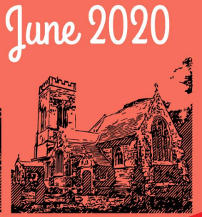
St Michael's Haselbech