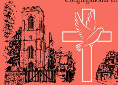
St Mary The Virgin, Welford