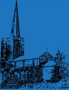
All Saints, Naseby