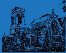
St Michael's Haselbeck