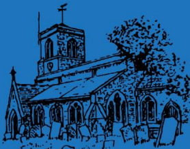
St Helen's Sibbertoft