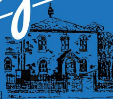
Welford Congregational Chapel