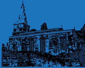
All Saints, Clipston