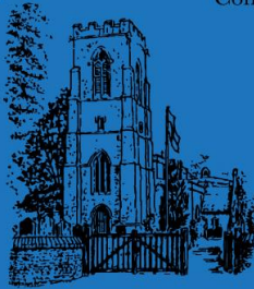
St Mary The Virgin, Welford