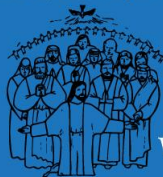
Haselbeck, Kelmarsh Marston Trussell, Naseby, Welford, Sibbertoft & Clipston