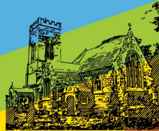
St Michael's Haselbeck