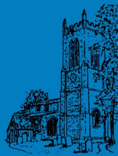
St Nicholas' Marston Trussell