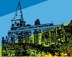
All Saints, Clipston