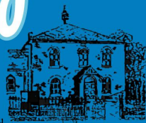
Welford Congregational Chapel