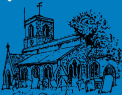
St Helen's Sibbertoft