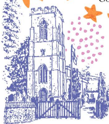
St Mary The Virgin, Welford