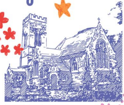
St Michael's Haselbech