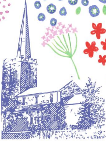
All Saints, Naseby