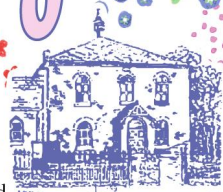
Welford Congregational Chapel