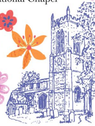
St Nicholas' Marston Trussell