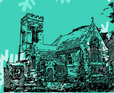
St Michael's Haselbech