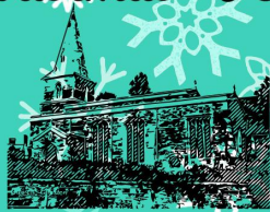
All Saints, Clipston