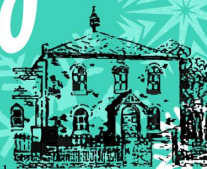
Welford Congregational Chapel