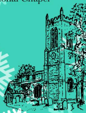
St Nicholas Marston Trussell