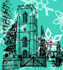
St Mary The Virgin, Welford