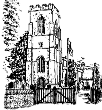
St Mary The Virgin, Welford