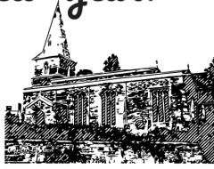
All Saints, Clipston