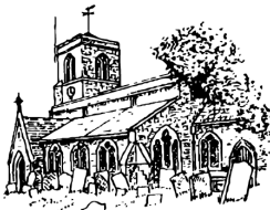
St Helen's Sibbertoft