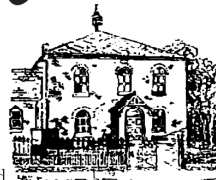
Welford Congregational Chapel

... Nothing can dim the light that shines from within Maya Angelou