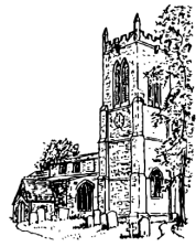
St Nicholas' Marston Trussell