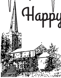
All Saints, Naseby