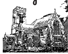
St Michael's Haselbeck