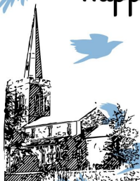
All Saints, Naseby