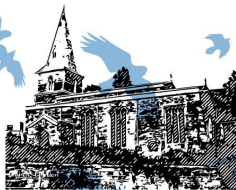
All Saints, Clipston