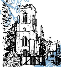
St Mary The Virgin, Welford