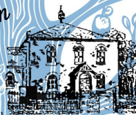
Welford Congregational Chapel

"It can only be achieved by understanding." Albert Einstein