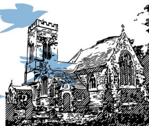
St Michael's Haselbech