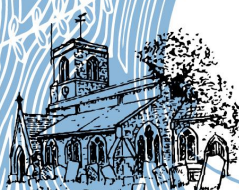
St Helen's Sibbertoft