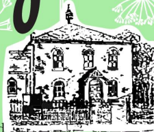
Welford Congregational Chapel

even when you don't see the whole staircase