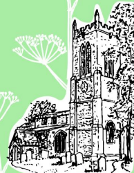
St Nicholas' Marston Trussell