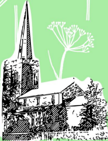
All Saints, Naseby