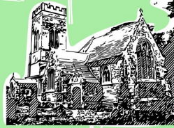
St Michael's Haselbeck