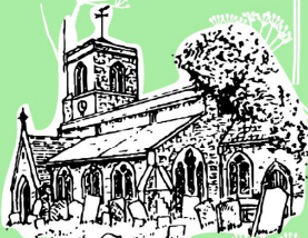
St Helen's Sibbertoft