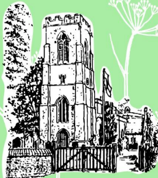
St Mary The Virgin, Welford