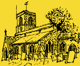
St Helen's Sibbertoft