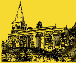
All Saints, Clipston