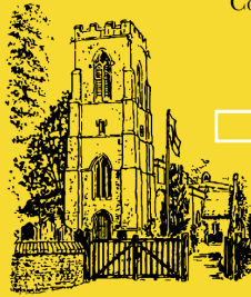
St Mary The Virgin, Welford