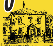
Welford Congregational Chapel