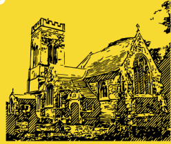
St Michael's Haselbech