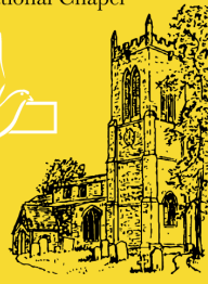
St Nicholas' Marston Trussell