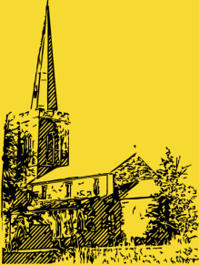
All Saints, Naseby