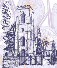
St Mary The Virgin, Welford