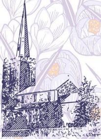
All Saints, Naseby