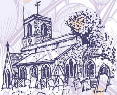
St Helen's Sibbertoft