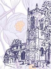
St Nicholas' Marston Trussell