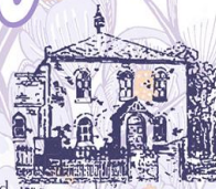
Welford Congregational Chapel