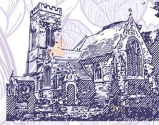
St Michael's Haselbeck