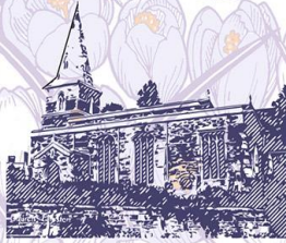
All Saints, Clipston