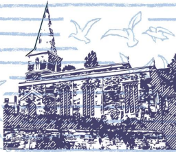
All Saints, Clipston