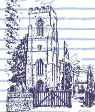
St Mary The Virgin, Welford