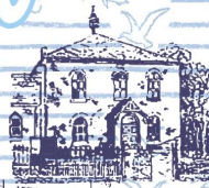
Welford Congregational Chapel