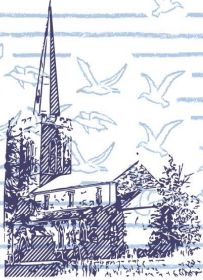
All Saints, Naseby