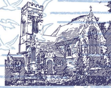
St Michael's Haselbeck