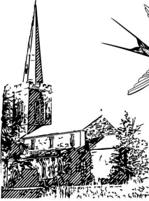
All Saints, Naseby