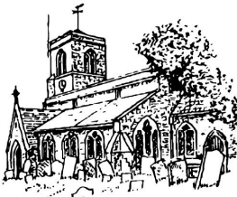
St Helen's Sibbertoft