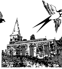
All Saints, Clipston