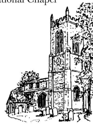
St Nicholas' Marston Trussell