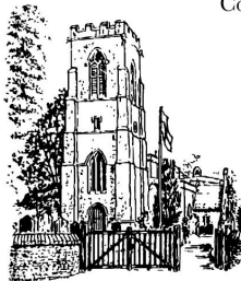
St Mary The Virgin, Welford