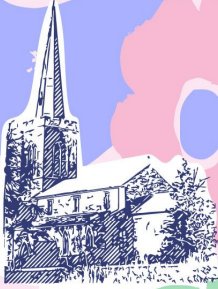
All Saints, Naseby