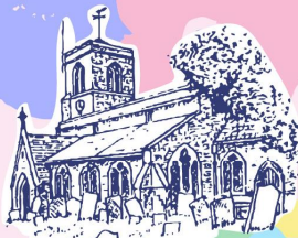
St Helen's Sibbertoft