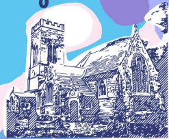
St Michael's Haselbeck