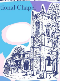
St Nicholas' Marston Trussell