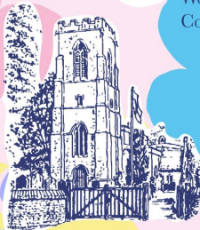
St Mary The Virgin, Welford