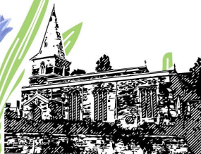
All Saints, Clipston