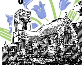
St Michael's Haselbeck