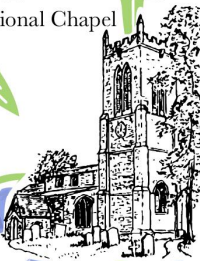
St Nicholas' Marston Trussell