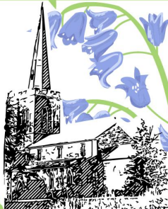
All Saints, Naseby