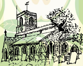
St Helen's Sibbertoft