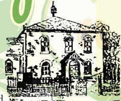
Welford Congregational Chapel

... But who can count the apples in a seed?