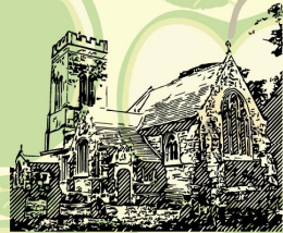
St Michael's Haselbeck