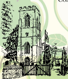
St Mary The Virgin, Welford