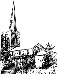
All Saints, Naseby