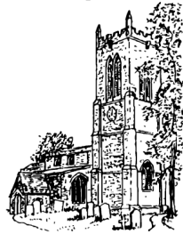
St Nicholas' Marston Trussell