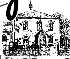
Welford Congregational Chapel