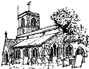
St Helen's Sibbertoft