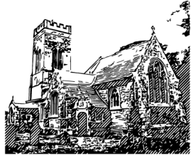
St Michael's Haselbeck