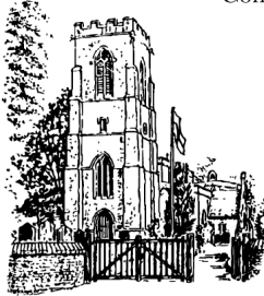
St Mary The Virgin, Welford