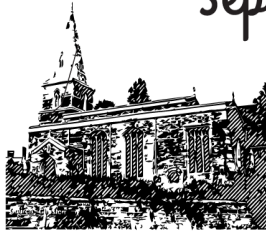
All Saints, Clipston