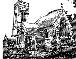
St Michael's Haselbech