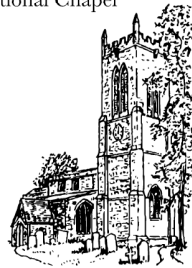
St Nicholas' Marston Trussell