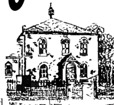
Welford Congregational Chapel

Nothing can dim the light that shines from within Maya Angelou