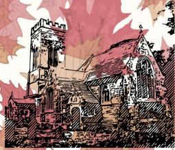
St Michael's Haselbeck