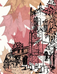
St Nicholas' Marston Trussell Haselbeck, Kelmarsh