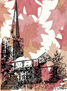
All Saints, Naseby