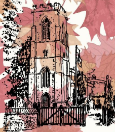
St Mary The Virgin, Welford