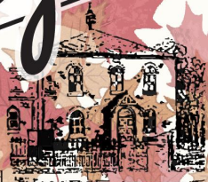
Welford Congregational Chapel